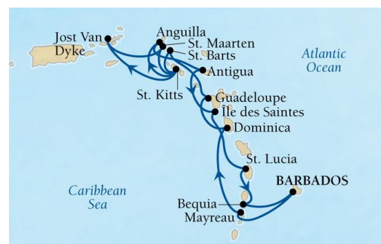
14 day cruise